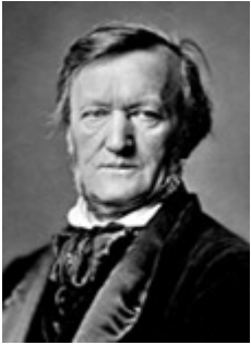
Richard Wagner - "Tristan und Isolde", Prelude

Listening to classical music can be very relaxing and can help you feel calm and at ease. Today listen to this piece of music by Richard Wagner and discuss together how it made you feel.